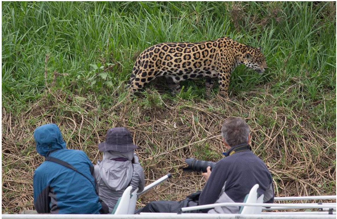
Young Jaguar "Patricia" concentrates, stalking a riverbank caiman, captivating a boatload of visitors

SouthWild can always design and operate private, customized departures for the Jaguars. Please ask our team of travel planners for details.