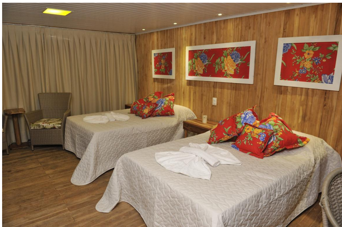
A Jaguar Suite: 30m 2 (323ft 2 ), huge picture window, 2 beds 128cm-wide (50 inches)

The Jaguar Suites Flotel features custom-designed, extremely spacious, 30-square-metre (323-square-foot) rooms, clearly the finest, most convenient guest rooms of any terrestrial or floating lodge in the entire Pantanal. Each Jaguar Suites room has a "ginormous", 3.6-metre-wide, floor-to-ceiling picture window that slides open to give you access to your own private, 5m x 1.6m, screened porch. No other rooms anywhere in Pantanal afford the scenic view offered by Jaguar Suites, namely the 100-m-wide Cuiabá River and the wilderness of the 270,00-acre Meeting-of-the-Waters State Park (MOWSP). This park is 250% the size of the largest Costa Rican park and harbors a higher density of Jaguars than anywhere else on Earth. In fact, MOWSP certainly harbors more Jaguars than all of Costa Rica. Our Jaguar Research Center Reserve is a private inholding in the state park and represents the most famously Jaguar-rich part of the park.