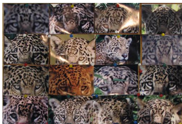
Rogues' Gallery: A page from SouthWild's Jaguar Face Dossier