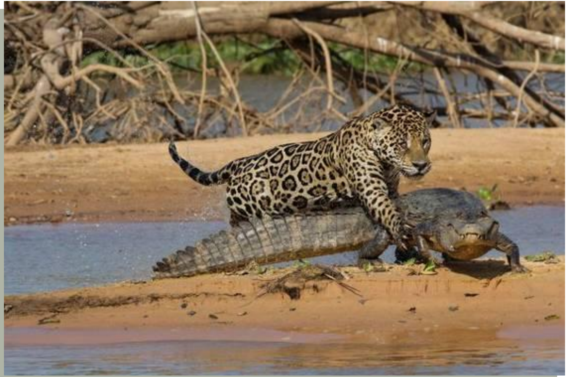
“Mick Jaguar”, Superstar